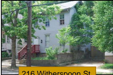
216 Witherspoon St.

Portfolio of Five Residential Properties Princeton, New Jersey 08542 $2,160,000