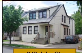
240 John St.