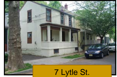
7 Lytle St.