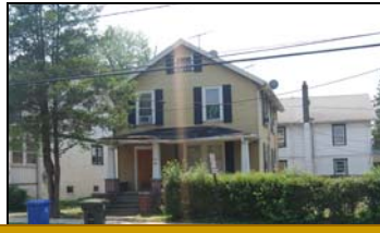
274—276 Witherspoon St.