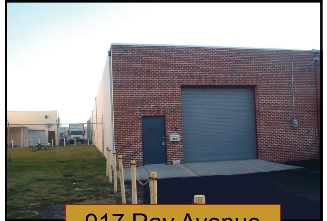
917 Ray Avenue